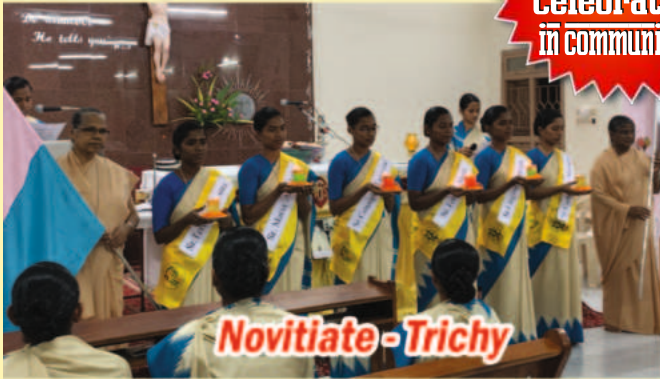
Novitiate - Trichy